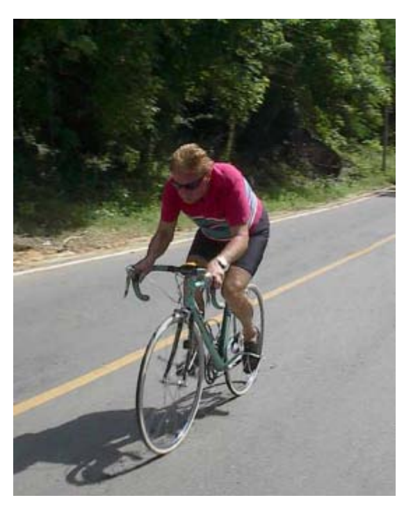
On one of the long drags, when I was 72.

Speaking for myself I can relate to you why I felt it was unwise for me to continue with my daily bike ride here in Phuket. Up until two years ago I was doing a daily 26km fairly hilly ride in 30C degree + heat. Started out from home, headed due south, then over some short steep hills and a couple of long drags.