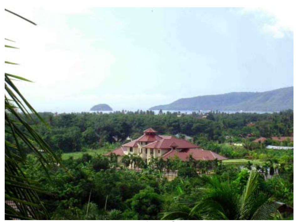
101 House from Skeggs