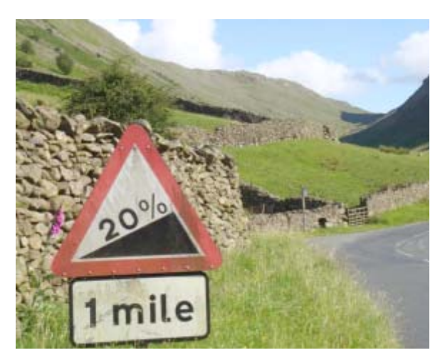
"YES, IT'S STEEP!"

18% with the last section touching 20%. Fortunately I knew the climb having ridden it on several occasions and paced myself well up it, overhauling one of the guvs who'd set off far too fast. We'd already dropped the third guy in our group. I was beginning to wish for a lower gear than the 39-23 I was churning round but wasn't an option and there was no way I was going suffer the humiliation of walking!